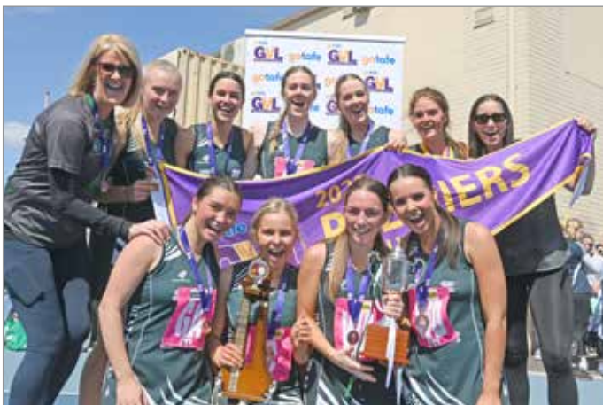
17&U Premiers: Echuca Bombers