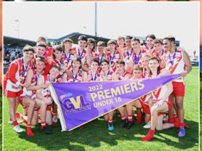
U16's Premiers: Shepparton Swans