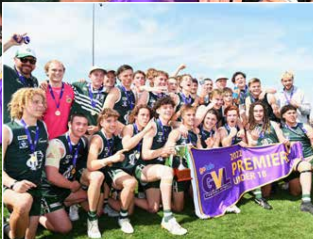
U18's Premiers: Echuca Bombers