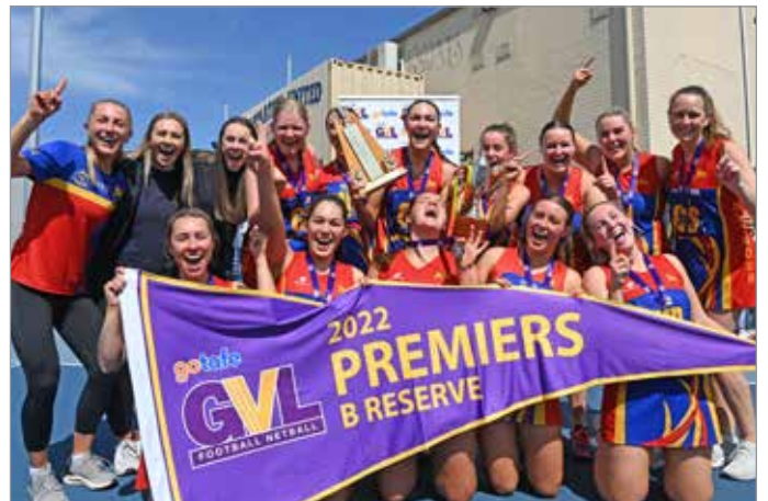
B Reserve Premiers: Seymour Lions