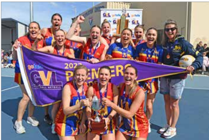
B Grade Premiers: Seymour Lions