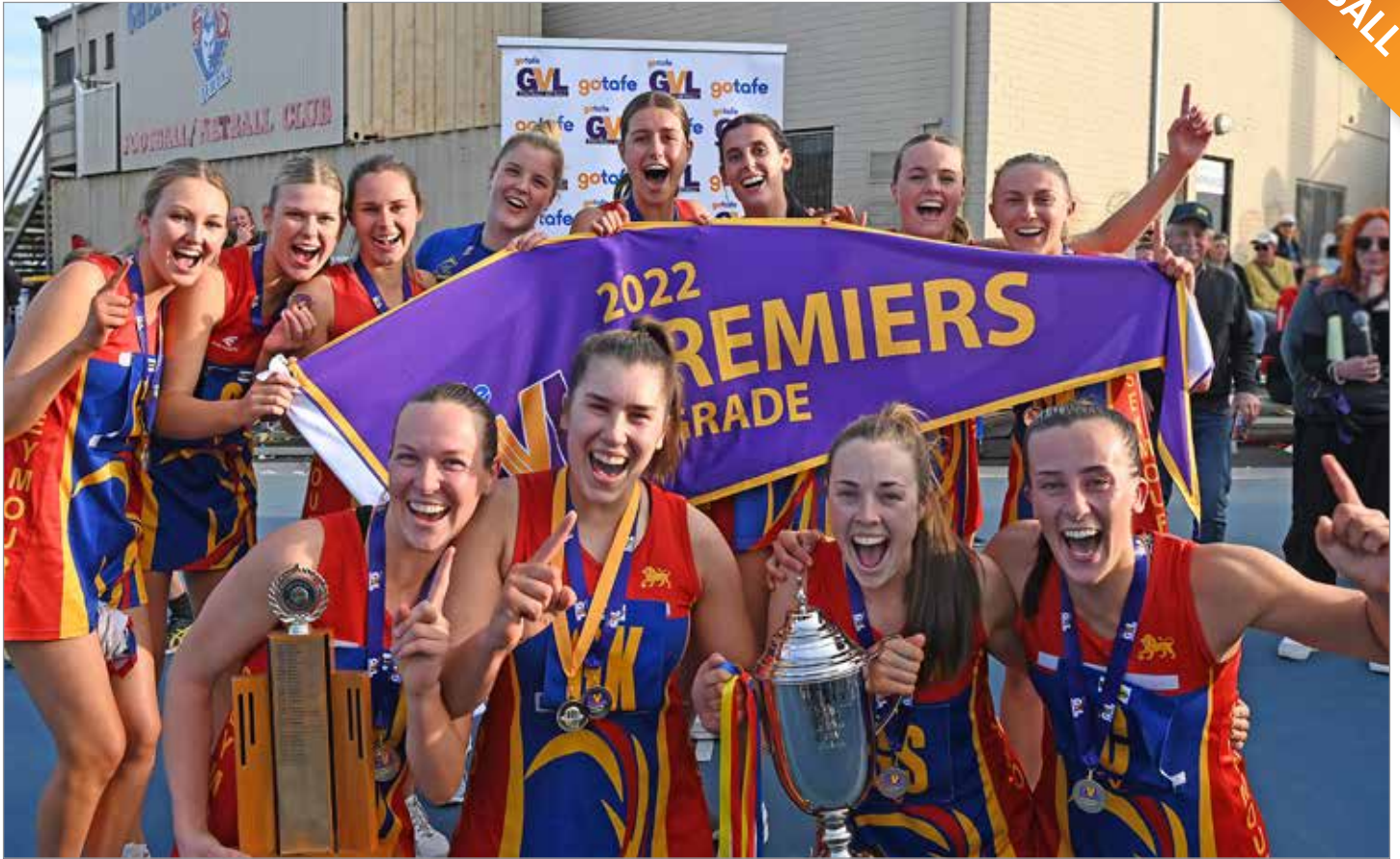
A Grade Premiers: Seymour Lions