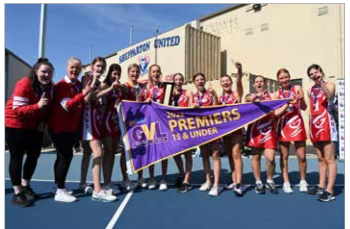
15&U Premiers: Shepparton Swans