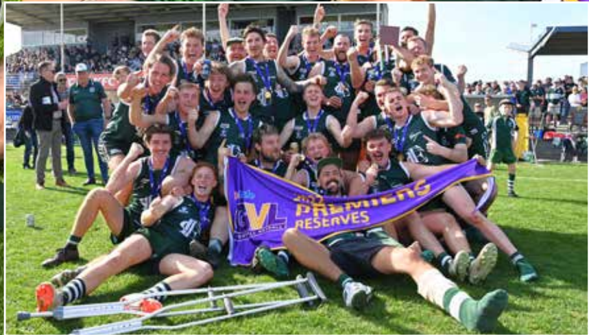
Reserves Premiers: Echuca Bombers