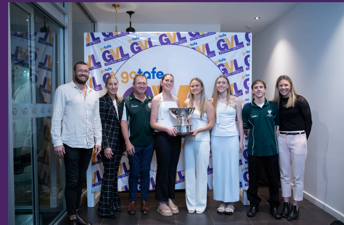
2025 George Hunter Champion Club - Echuca FNC

2 x GVL Season Passes, 2 x Invitations to all League events including the official Grand Final function and the League's Best & Fairest.